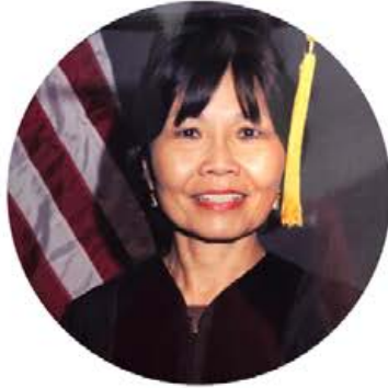
Occupational Therapy Professor