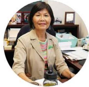
HCSS Vice President

The HCSS Campus 13151 W. Airport Blvd Sugar Land Texas 77478